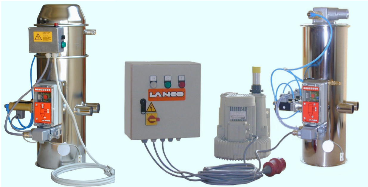
LA 20 -Z - single phase motor

for automatic transport of free flowing materials with bulk density of 0,4... 0,8 kg/Litre and max Temp. of 80 °C